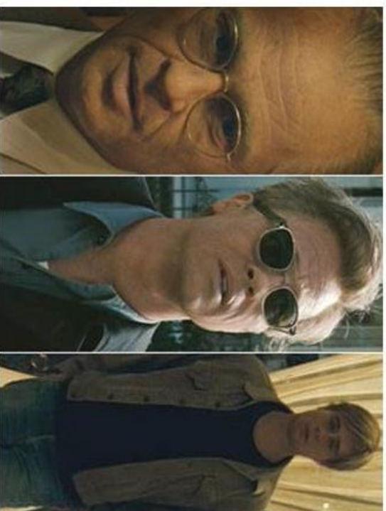
The Curious Case of Benjamin Button, 2008